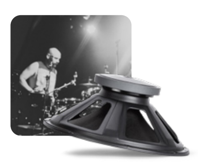
BASS MOTION CONTROL