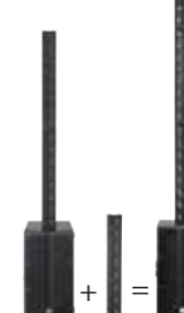
Top-Add-On: 1x E 835