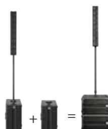
Sub-Add-On: 1x E 110 SUB