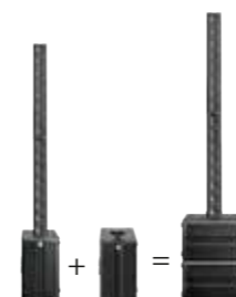
Sub-Add-On 1x E 110 SUB