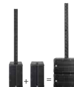
Sub-Add-On: 1x L SUB 1200