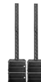
Largest configuration 2,400 watt Line Base Twin with Sub-Add-On