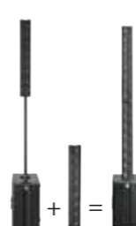
Top-Add-On: 1x E 835