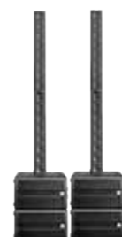
Largest configuration 2,400 watt Smart Base Twin with Sub- and Top-Add-On